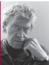
"A painter who paints can by that very act seduce his inner conflict."